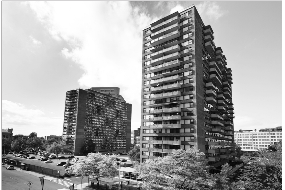
More than 26,000 cubic yards of chromium-impacted soil and debris located several feet below ground will be removed from the Metropolis Towers complex.